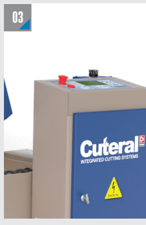
KUMANDA PANELİ CONTROL PANEL