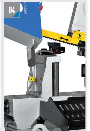
DAYAMASIZ HASSAS KESİM ACCURATE CUTTING