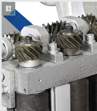
MALZEME SÜRME SİSTEMİ MATERIAL FEEDING SYSTEM